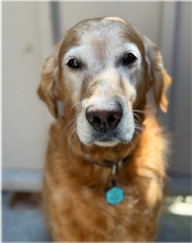
Rush~10 ~D Zelitzky