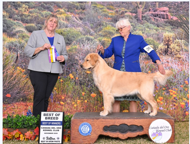
Indie, Zolotas Miss Independence