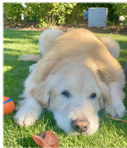
Bacall~12.5 ~D Ramsey