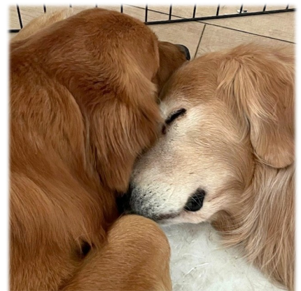
Baxter~13.5 ~A Mraz