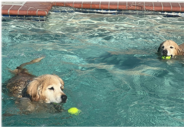
Elton and Cecilia~10.4 ~J Wolfe