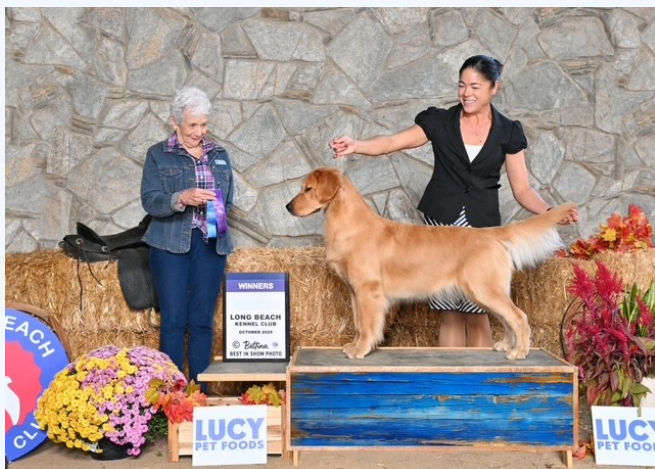
Dandi, Seasons Regalgold Dashing Thru The Show