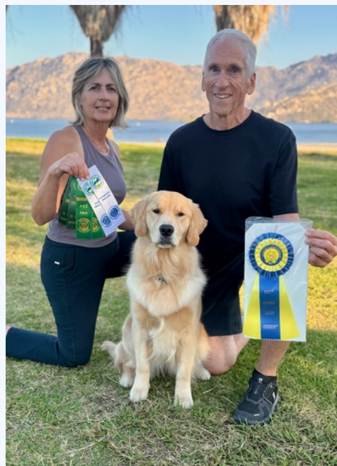
Demi, Rosecreek's Here We Go Again CGC TKI FTN FDC.

Demi has been busy having fun and working on back titles. At 9 months, she earned Canine Good Citizen, Trick Dog Intermediate, Fetch Title Novice and Farm Dog Certified. Demi is from the Pop Star litter - BISS GCH Emery's Star Baker OS x GCH Rosecreek's Sweet Emotion BCAT ACT1 ACT1J. So proud of this puppy. Demi- Rosecreek's Here We Go Again CGC TKI FTN FDC.