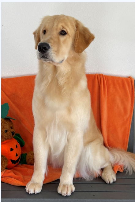
Drama, Calico's Making A Scene BN RN CGCU TKN VSWB

Drama is now, Calico's Making A Scene BN RN CGCU TKN VSWB Drama, was entered on 11/2, at the Obedience/ Rally trials. We together, as a team, successfully completed her BN & RN titles with placements. This time around, I DID NOT, skip any signs in Rally causing us to fail. Yes, I did that, I always said it would NOT be the dog who fails it would be ME! New to Rally since Feb. of this year I am having a blast and loving the bond it creates!