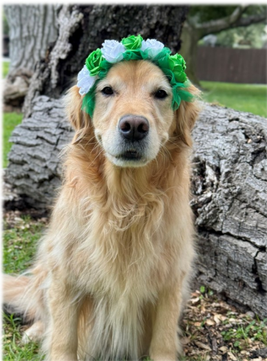
Summit~9 ~S Dochmaschewsky