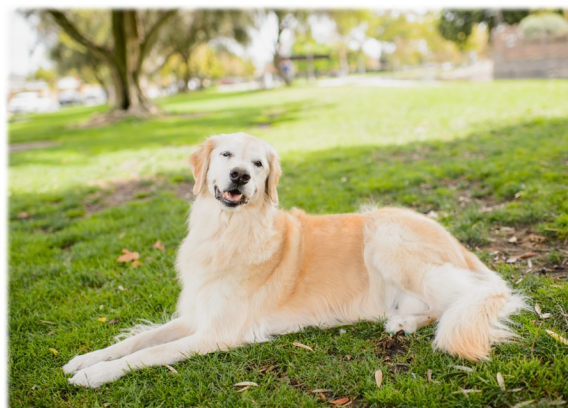
Baylee~14 ~A Mraz