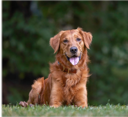
Brew~8 ~T Chang