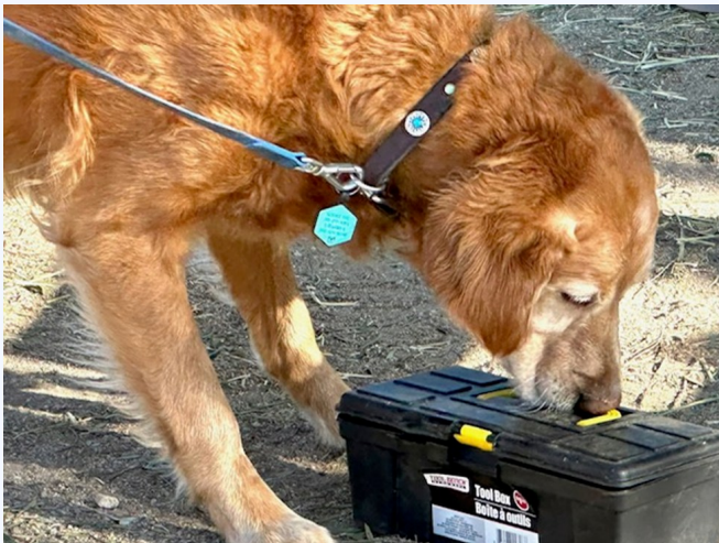
Rush, OTCH Firemark's Free Fall UDX4 OM6 RA

Rush turned 10 on November 1. He became a certified therapy dog this year and finished his Nose Work Novice title in one weekend last October. We've dabbled a bit in field work as well. He came to me at three years old with no titles or show experience and I have loved every minute of our training and companionship.