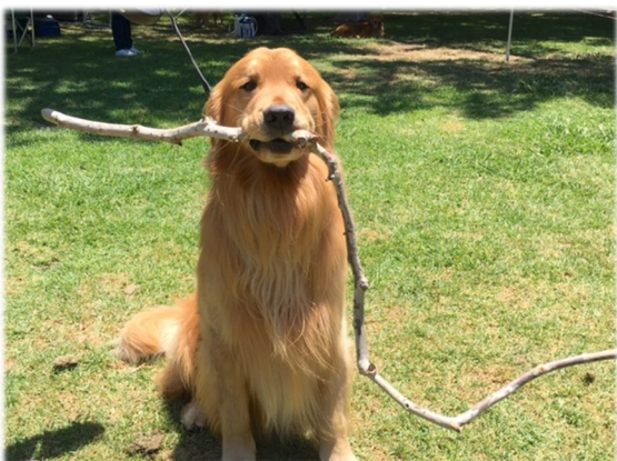
Blayze~7 ~A Mraz