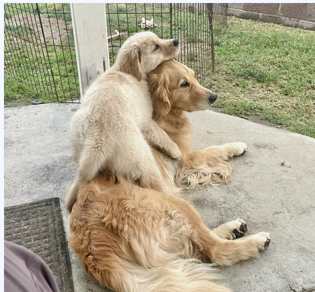
Magic, Esquire's Two Believe In Magic NJP RI CD-V TKN CGC CCA

Magic, who has, lovingly, mentored another puppy, Frolic, celebrated her eighth Birthday on November 20th. Magic loves to play and train and twirl and has mega patience with each addition to our canine family. WOW! She's officially a senior! How time flies!