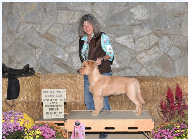
Frolic, Geaux Dog's Jus' Wanna Have Fun