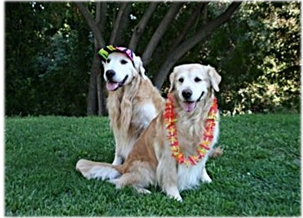
Wings & Deli on their 12th birthday back in Sept. 2012.