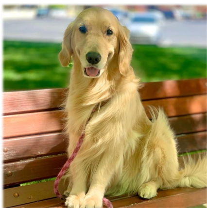
Rosie 2016-2024