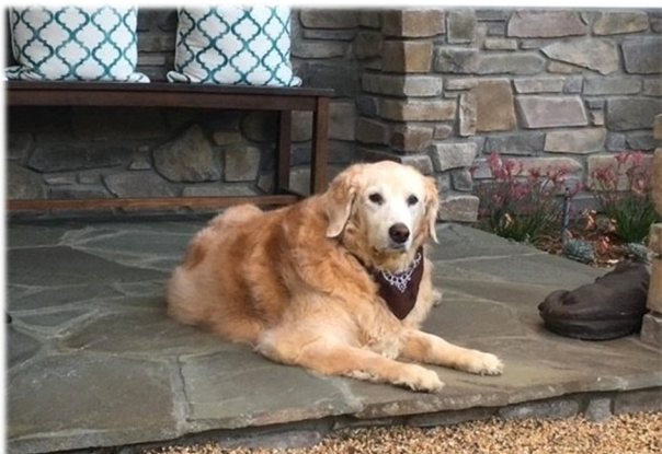
Molly 2004-2017