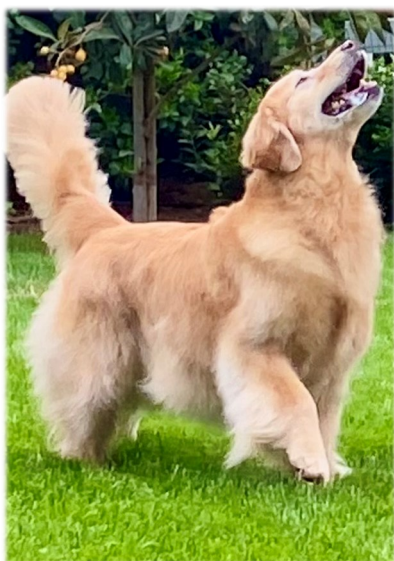
Jill~11.5 ~D Ramsey