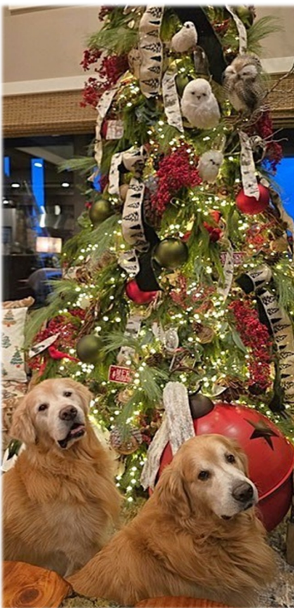
Jake~11 / Maxx~9 ~T Beattie