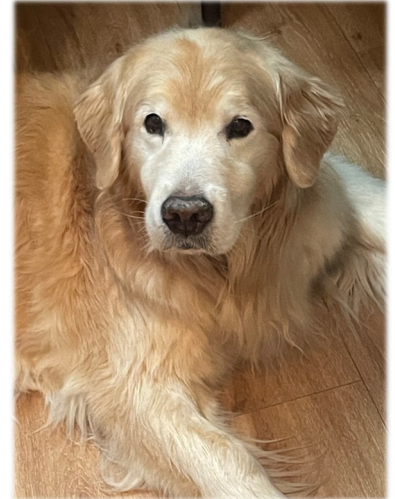
Tease~11.5 ~S Shilkoff