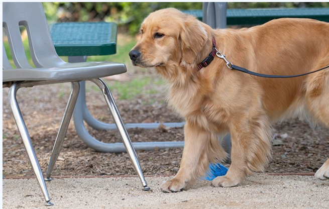
Summer, CH Woodland Hot Stuff

Summer, CH Woodland Hot Stuff completed her SWN title October 4 at the Scent Work Club of the San Gabriel Foothills. And father Nick, CH Verdoro's National Treasure completed his SIN at the GRCA National Specialty at Purina Farms in September and at the Scent Work Club of the San Gabriel Foothills completed his SEN!