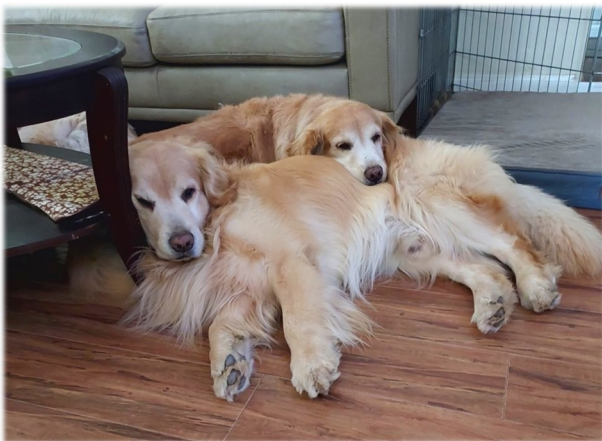
This is mother and son. Rogue, 7 and his 11 year old mother, V. V will actually be 12 in February! They are so sweet together.