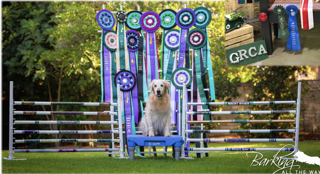
Ryder~15.5 ~T Chang