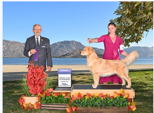
Demi, Rosecreek's Here We Go Again CGC TKI FTN FDC