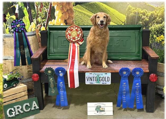
Rio~12.5 ~T Chang