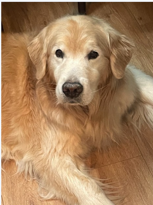
Tease, GCH CH Woodland Sunbeam Four Play OA OAJ

GCH CH Woodland Sunbeam Four Play OA OAJ---11 1/2 yrs and still going strong and will be trying for those last two AXP legs. Mom is taking her time.