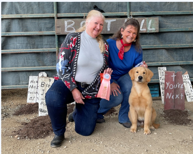
Sanders, Calico's Secret Recipe TKI