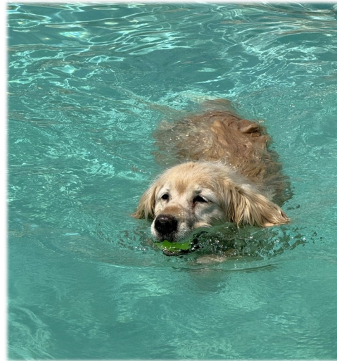
Violet~13.9 ~J Wolfe