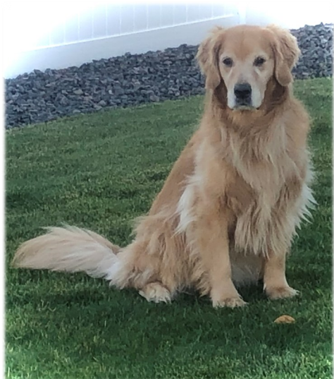
Fire Burst's Party Girl, CGCA, FDC (Violet)~7 ~Barbara Parker Fox