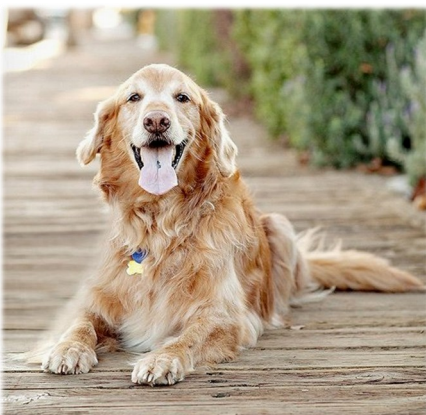
Beau~9 ~A Mraz