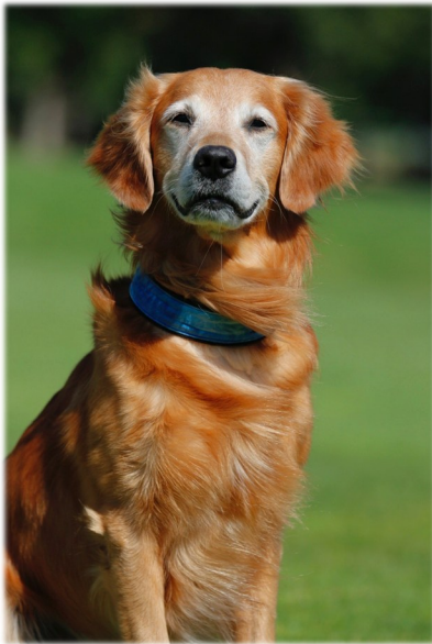
Edge~10 ~T Chang