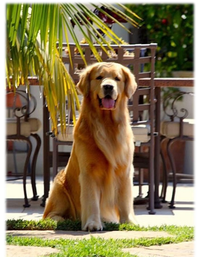
Chuck~7 ~D Ramsey