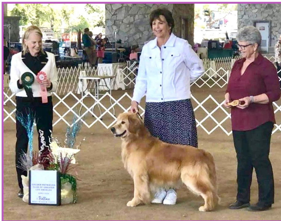
Jazz, BISS GCH CH Dalane You Make Me Feel So Young CGC BN RI TKI