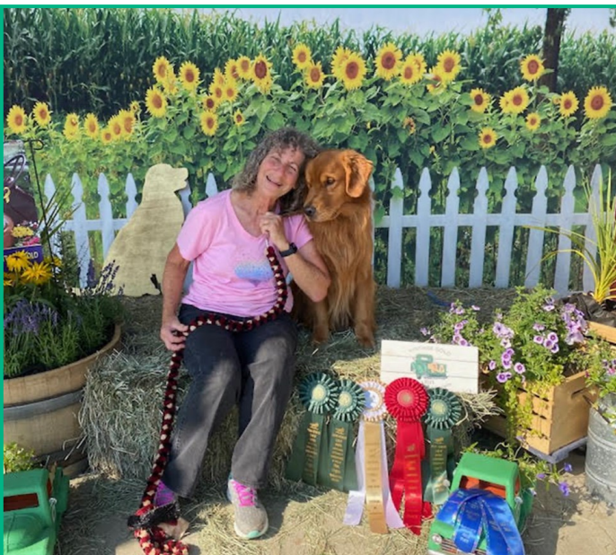
Breezy: Esquire's Sweet Days of Summer RN, NA, OF, CCA, FITB

Breezy earned 2 Novice Agility titles, an Open FAST leg, a Beginner Novice leg, a Rally Intermediate leg, his CCA and sailed around the Open Dog conformation ring the weekend of our wonderful 2023 GRCA National in Albany Oregon. A few months later Breezy completed his Open FAST Agility title! As an added bonus Breezy learned to leave the agility course cones alone! YEAH! I am looking forward to a fun and fabulous future with my talented boy! Go Breezy!