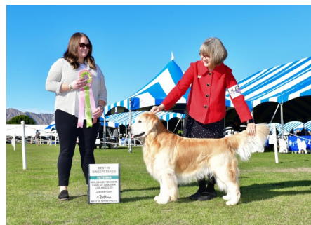
BEST IN VETERAN SWEEPS