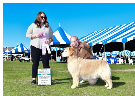
BOS IN VETERAN SWEEPS