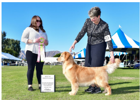
BEST IN SWEEPS