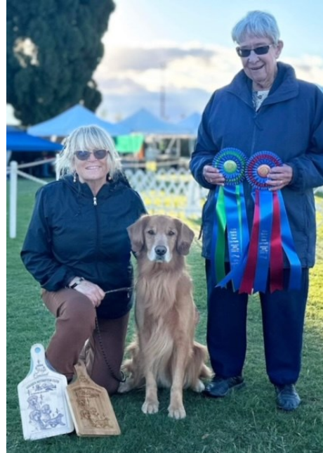
RALLY HIGH COMBINED, HIGH TRIPLE OTCH9 SUNFIRE'S PRIDE AND JOY, UDX7 OGM BN RM RAE AX OAJ NF DS CGC TKA