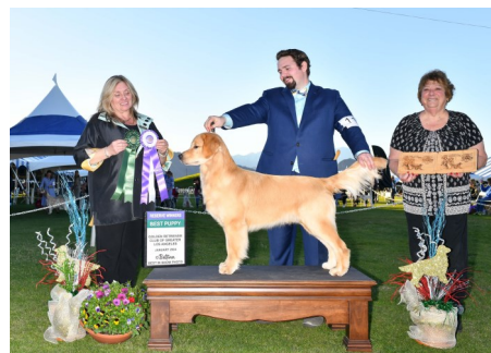
RWD and BEST PUPPY