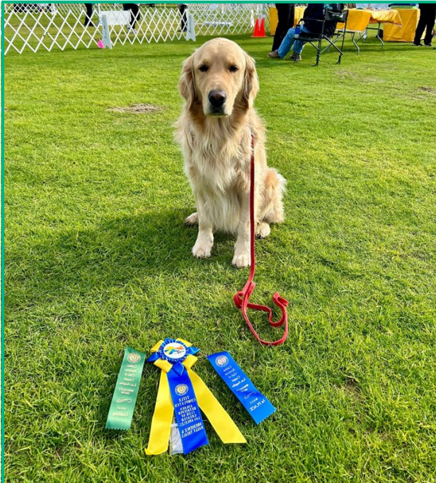
Hoku: Trilogy's Hoku'alohe Brilliant Star BN, RN

Beginner Novice OB and Novice Rally Titles for Hoku at the GRCGLA Specialty! My Hoku is so excitabe. At the GRCA Nationals in Oregon we were hopeful, but Hoku jumped on the judge in the Novice OB (he did well almost to the end before the recall), needed to roll in the dirt on the Beginner Novice OB Sit/Stay, and bolted to play with his team in the Team Obedience. He did Q in the Novice Rally. Finally!