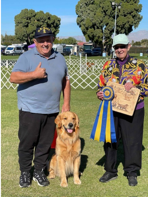
OBEDIENCE- HIGH IN TRIAL-Open B GOLDENRULE JOKER CLEAR SAILING AHEAD, RM BN CD