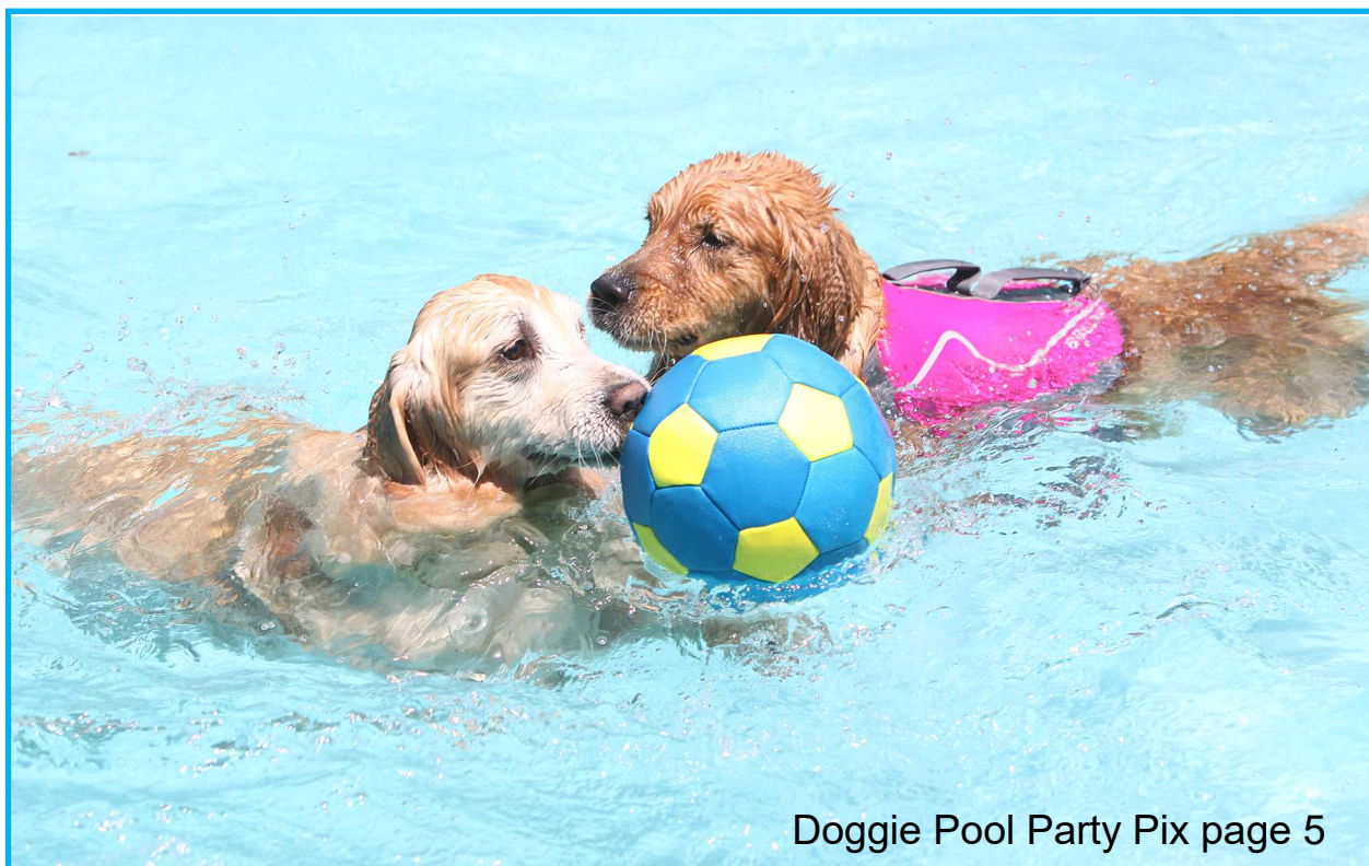
Doggie Pool Party Pix page 5